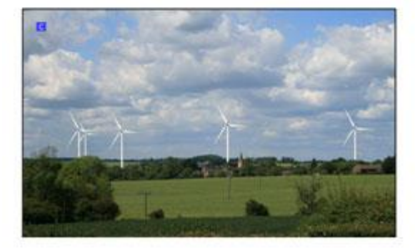
Standard wide-angle photo-stitch used by the industry to "demonstrate" lack of impact on landscape

The same project and virtually the same viewpoint but using a 55mm lens to reflect more accurately what the human eye actually sees, and what people actually experience