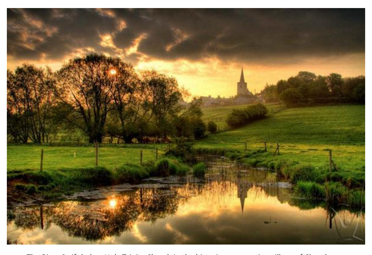
The River Swift below Holy Trinity Church in the historic conservation village of Churchover